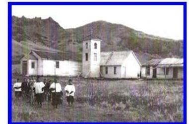
St. Peter's Mission 1884