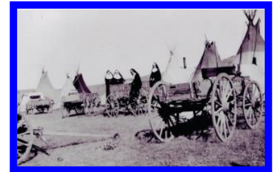
St. Labre Mission